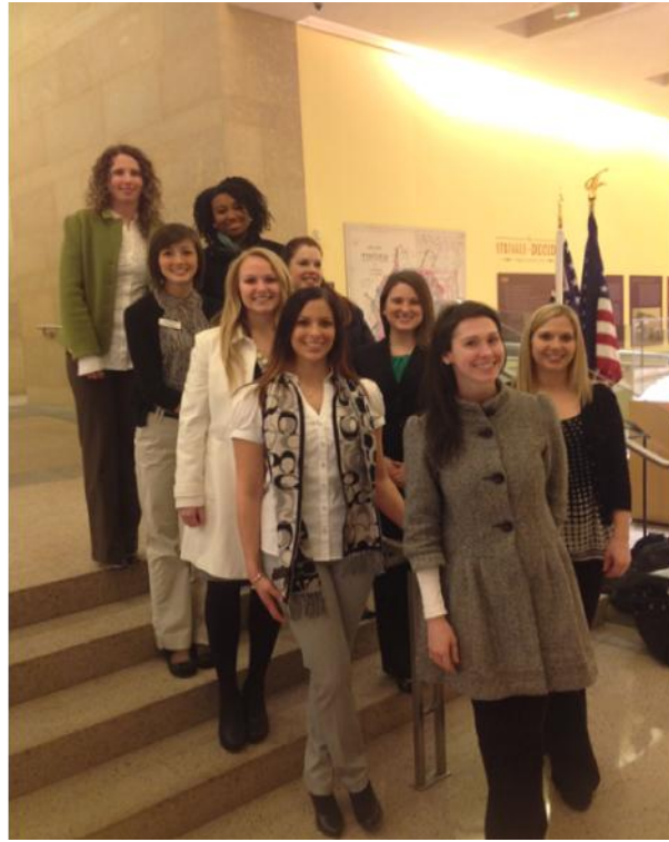
Seniors from Thomas Nelson Community College