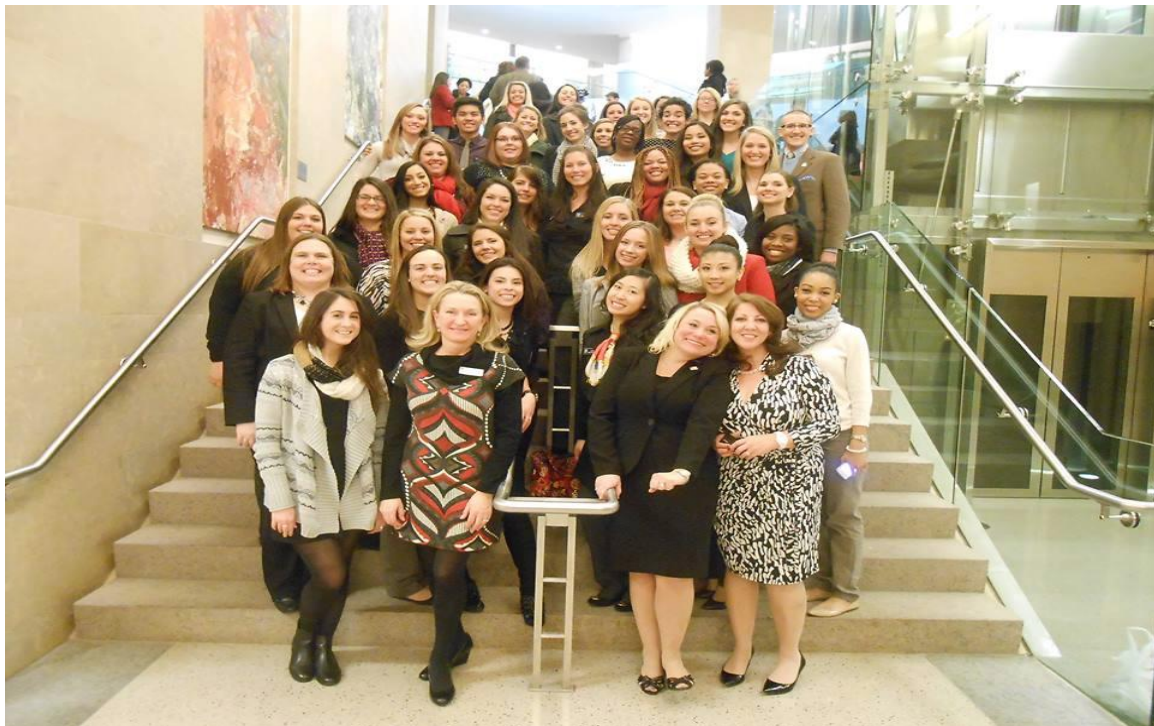
ODU Class of 2014 and faculty