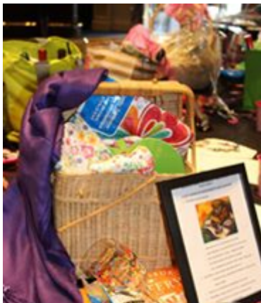
Basket donation for VHY PAC fundraiser at VDHA's 2016 Scientific Session

Please include the following information with your check: your occupation and employer, your address and email. We have to report all contributions and need the information for reporting to the state board of elections. Thank you!