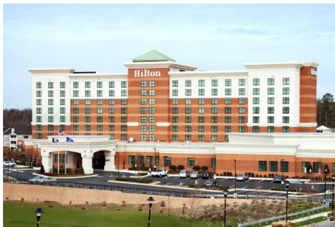
Hilton Richmond Hotel, Short Pump