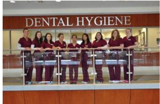
TNCC DNH Class of 2018