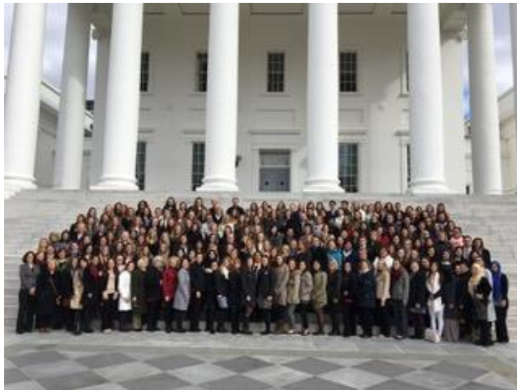
Dental Hygienists Supporting Our Profession