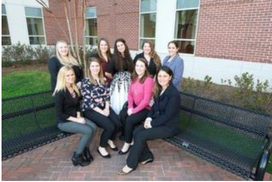
TNCC DNH Class of 2017