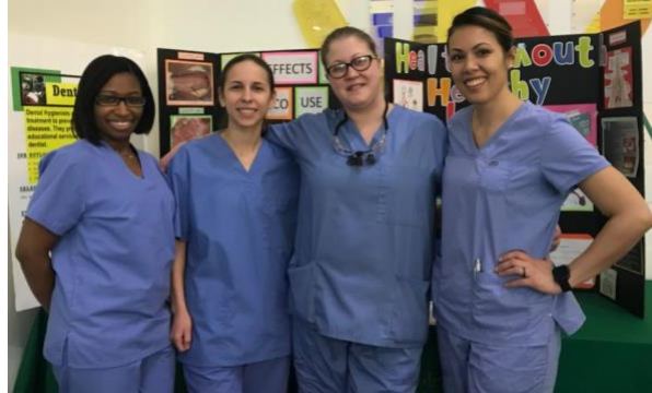
[First/Second Year DH Students]

While the class of 2018 is nearing graduation, the class of 2019 is looking forward to being “almost” considered second year dental hygiene students. The NVCC Medical Education Campus holds an annual health fair & walk every April called Walk4Life. First and second year dental hygiene students participate in this event and offer free oral cancer screenings, oral hygiene instructions, and distribute oral hygiene bags for those interested. Other health screenings provided at the event include vision, hearing, and blood pressure; with other activities including games, meditation, general health information tables, and food. The dental hygiene students at NVCC feel proud to participate in a health fair that allows them to build a lasting relationship with their community.