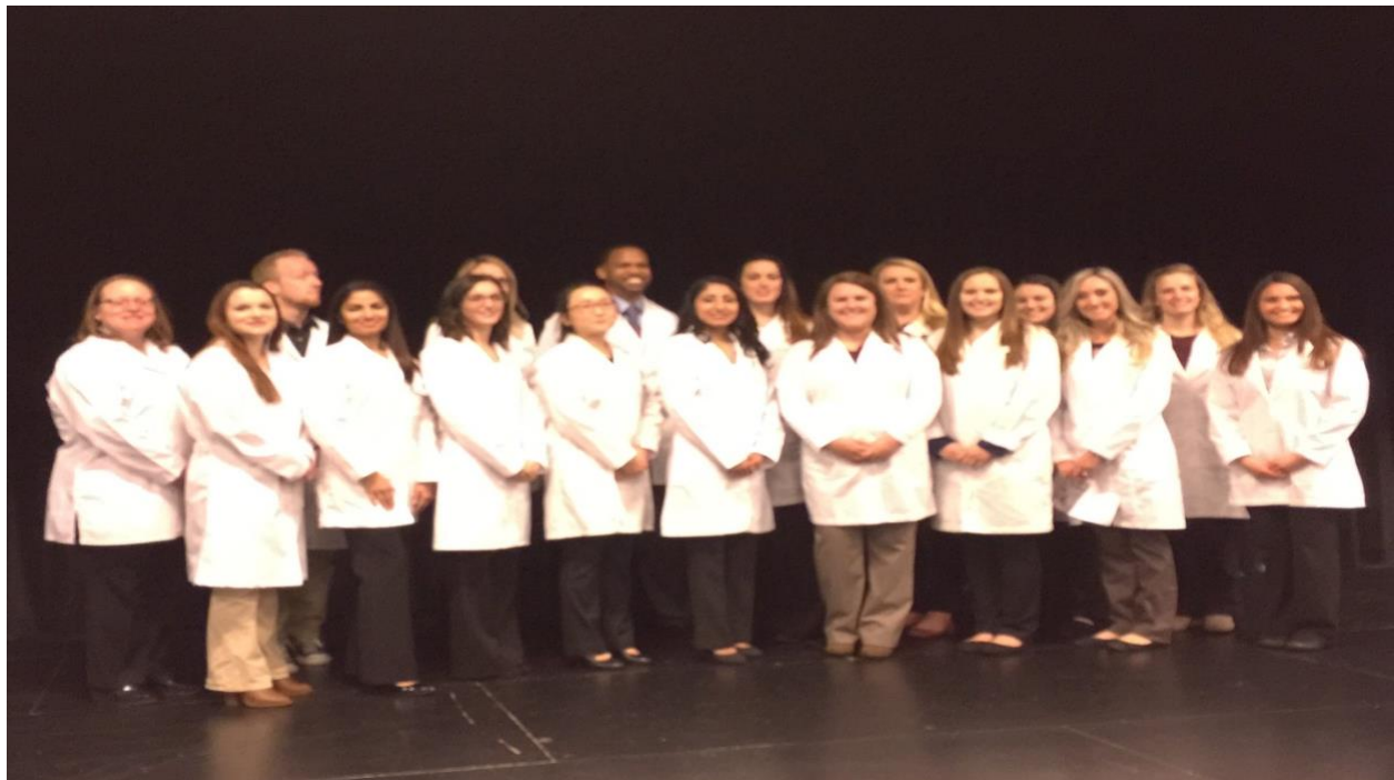
Class of 2018