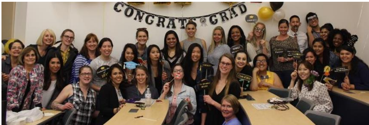
[NVCC Class of 2018]