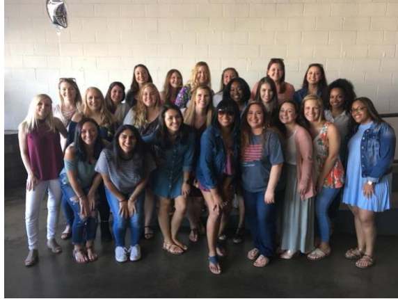
ODU new graduates

The Tidewater component of the VDHA held a “New Graduate Celebration Reception” at the O’Connor Brewery in Norfolk. Each new grad received a personalized name tag for the Association and a huge welcome to the profession of dental hygiene.