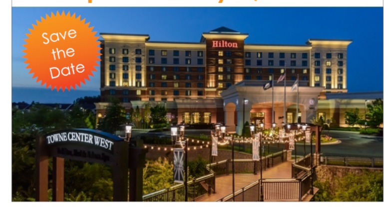
Hilton Richmond Hotel & Spa/Short Pump 12042 West Broad Street, Richmond, VA

Details to follow in the mail and also on vdha.net