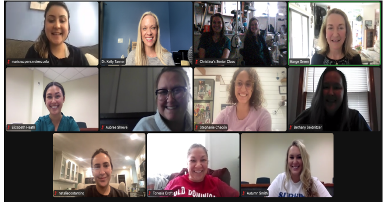
Virtual interaction with the awesome Class of 2022