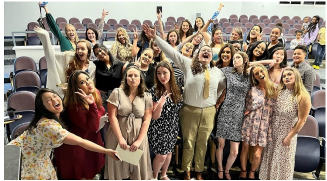
Senior and Graduate students celebrate their achievements at the SODH Awards Ceremony, May 5 th .

The ODU SODH is incredibly proud of the graduating Class of 2022! They walked across the stage on May 7 th as successful, ethical, and competent alumni of the SODH! Their accomplishments were celebrated in an Awards Ceremony on May 5 th and all were pinned into the profession! The faculty, staff, and students in the SODH worked tirelessly and safely this past semester and we are so proud of the accomplishments of the Class of 2022! All SODH students are winners, the below are highlighted for their achievements.