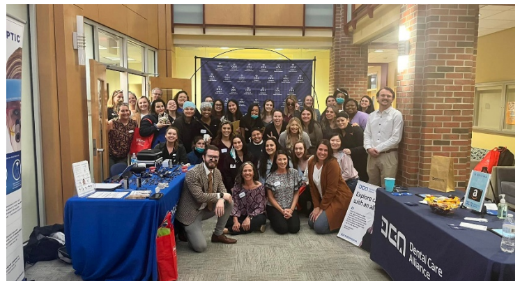
Junior and Senior Students at the SADHA/TDHA Beyond the Classroom Exhibit Hall.

In April, the ODU SADHA and the Tidewater Dental Hygienist's Association (TDHA) also jointly held an event for the rising Class of 2023 and the graduating class of 2022 entitled Beyond the Classroom. A wonderful panel of speakers who work in differing roles of the dental hygienist (public health, administrator, researcher, clinician, entrepreneur, corporate, educator) gave an informative discussion about their role in dental hygiene! The event also included an exhibit hall of dental hygiene practices seeking to recruit hygienists and give information about their offices, a VDHA/ADHA membership table, and loupes representatives! Congratulations Class of 2022!