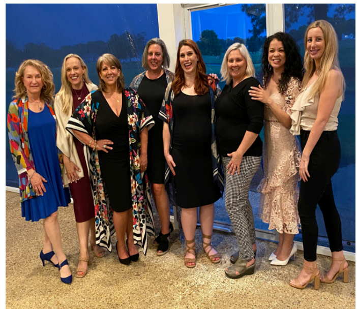
PDHC members, VDHA president, and VDHA Historian participated in Dental Hygiene Awards and Pinning Ceremony on May 6 th celebrating the Class of 2022. As you can see from the smiles, it was a glorious evening shared with the TNCC family and friends.