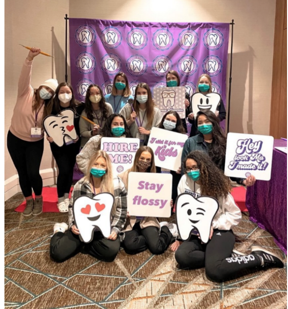
Above: ODU SODH Seniors at their National Board Review in Raleigh, NC.

Dear Colleagues, Spring is around the corner and greetings from the Old Dominion University School of Dental Hygiene (ODU SODH)! The Junior Class of 2023 will start seeing their first patients in clinic next week! I am sure we all remember how exciting and stressful this time can be! The Senior Class of 2022 has started their last semester of clinic and are busy in Community rotations providing valuable dental hygiene care to the public and underserved. The Seniors also just completed their national board review course in preparation for their upcoming National Boards! Way to go Seniors!