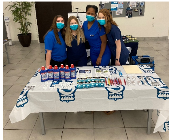
Above: ODU SODH Juniors attend the Student Organization Fair to give out program and clinic information and pass out oral hygiene aids to the student population.