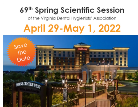
Hilton Richmond Hotel & Spa/Short Pump 12042 West Broad Street, Richmond, VA

Register now! The early bird rate ends March 25th, don't delay!