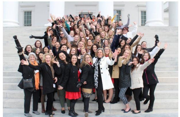
Above: All attendees of Rally Day 2020 on the Capital steps in Richmond, VA.