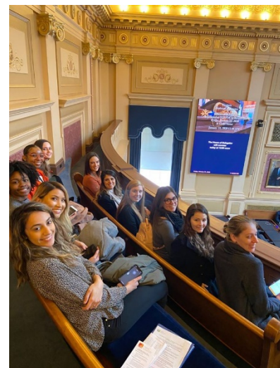
Above: ODU SODH Seniors in the Gallery of the House of Delegates where they were recognized on the House floor for their attendance at Rally Day 2020