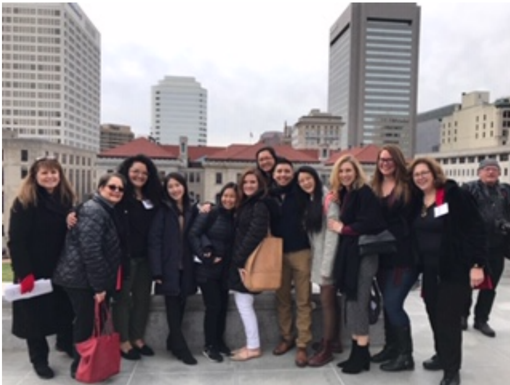
Rally Day, January