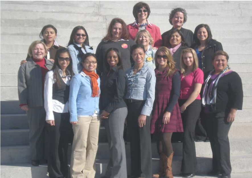
Northern Virginia Community College