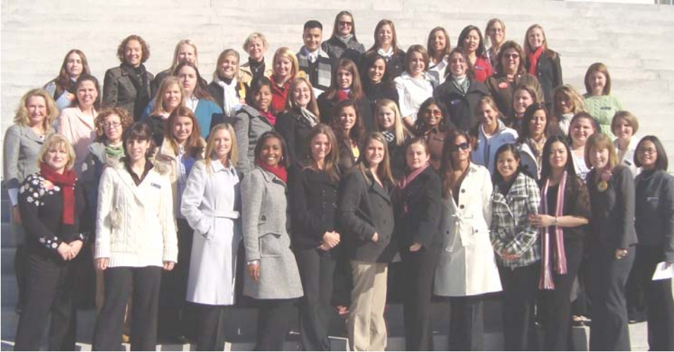
Old Dominion University