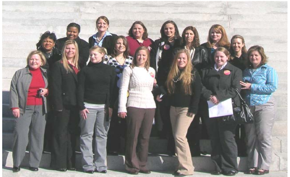
Central Virginia Community College