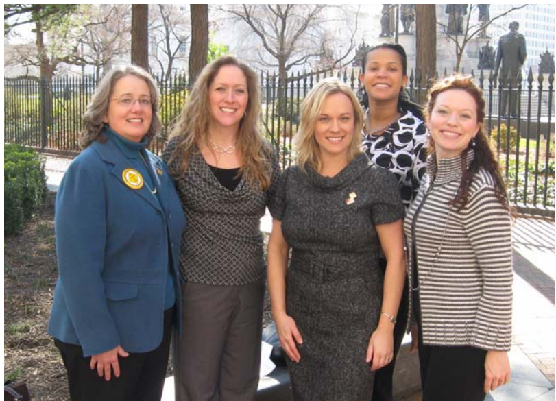
Wytheville Community College