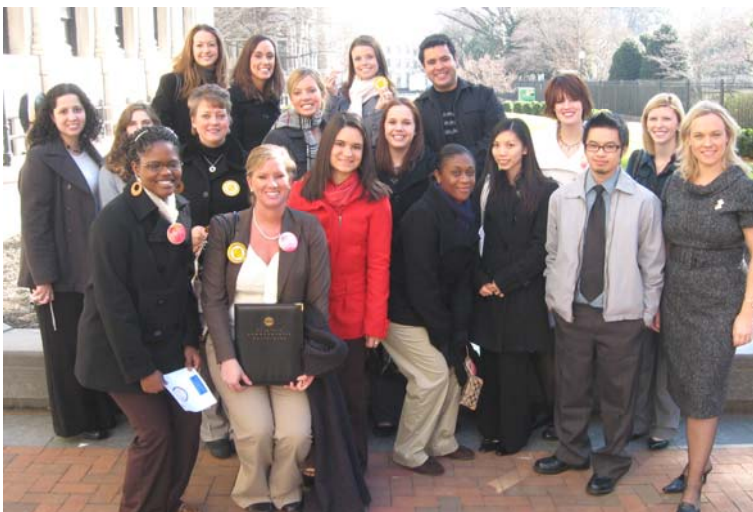
Virginia Commonwealth University