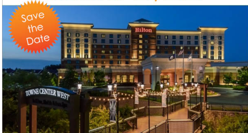
Hilton Richmond Hotel & Spa/Short Pump 12042 West Broad Street, Richmond, VA

Details to follow in the mail and also on vdha.net