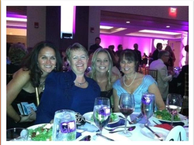
District III student delegates with VDHA President & President Elect